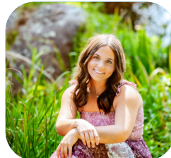
Aven Clarke Westmoreland Family YMCA