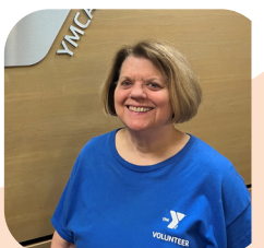
Merle Ledebhur YMCA Health & Wellness Center