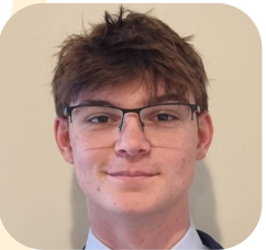
Finley Caisse Mathews Family YMCA