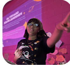
Nevaeh Washington Hampton District YMCAs